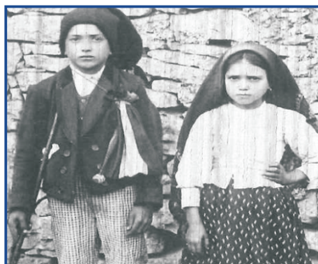
Santo Francisco Marto Santa Jacinta Marto