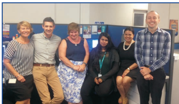
CatholicCare’s Customer Service Team

For more information about CatholicCare services, call 13 18 19 - 8am to 8pm Monday to Friday or visit our website at www.catholiccare.org