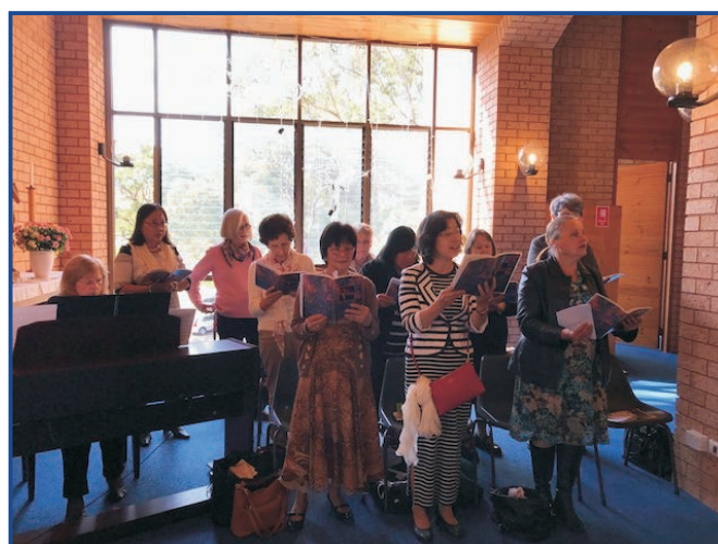
Northern and Southern Area Masses