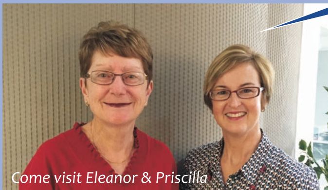
Come visit Eleanor & Priscilla

We are still here at CCD for all catechists enquiries and support