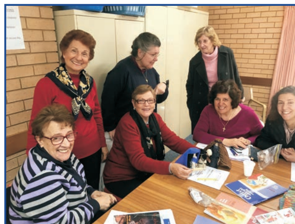
Training day at Our Lady of Fatima, Peakhurst.

Please ring or email if you need help and I will get back to you. Our Coordinators' meeting is on Thursday 13th July at Miranda CCD centre. This will start at 10 am and finish with a light lunch.