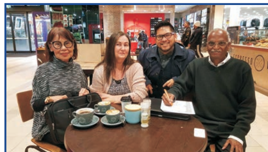
The 'Coffee Club', Prairiewood HS Catechists meet up for debrief after their Scripture class.